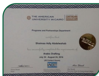
Arabic Drafting at American Univ...

Here are some of my training certificates mentioned above: